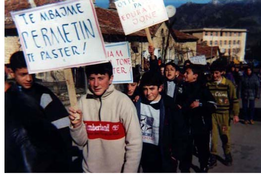
Photos: Aspects from mini-projects implemented by local NGOs in Permet and Kruja