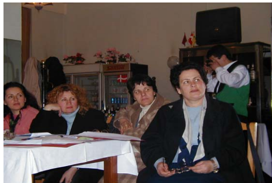
Illustrating photo of the training course

With regard to the participation in the seminar we can range the following figures: