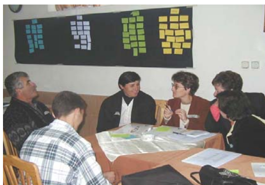
Work in Grups

We have already accomplished these activities based on the objectives of the project.