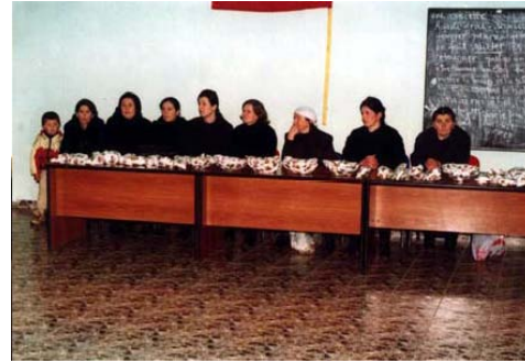
Photo: Aspects from the mini-projects implemented by Local NGOs in Burrel and Peshkopi

From the monitoring and evaluation of the results of the NGOs' mini-projects implementation, ACSF concluded that: